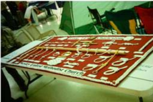
Troop 141 Knot Tying Display

February 9th was the 2008 Redhawk District Mall Show and Pinewood Derby race. There was a great turn out and the Scouts had a lot of fun. Below are some pictures from the event.