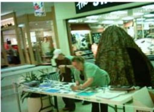
Venture Crew 911